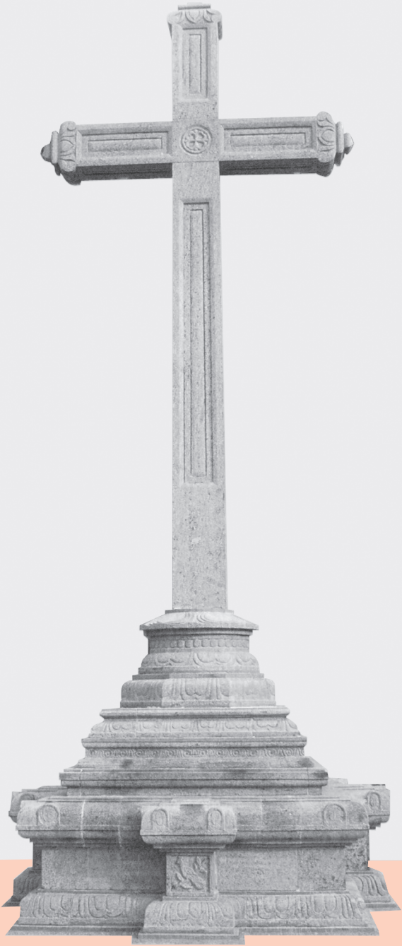
Mount Museum Rock Cross